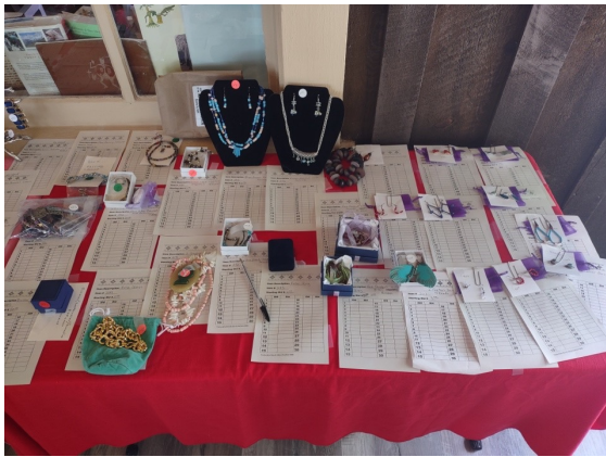
A little bit of everything!

The last events for the season are now in the rearview mirror. The Mystic Bluffs Fly-in and Annual Silent Auction/Labor Day BBQ were a tremendous success. The volunteers raised a significant amount of money because of the generosity of landowners who donated quality items for the Silent Auction. The money raised has stayed in the Timberlake community to help fund various projects since 2007 and the list is lengthy.